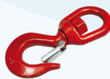
Swivel Hook with Safety Latch W.L.L. available from 1.000 Kg to 5.300 Kg