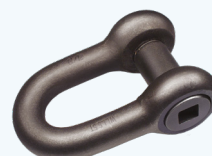
Trawling D-Shackle Socket Head Available from 20/22 mm to 25/28 mm W.L.L.: up to 5.000 Kg