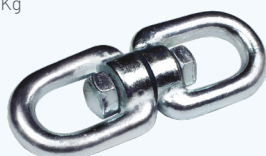
Eye/Eye Swivel Available from 6 mm to 25 mm W.L.L.: up to 3.600 Kg