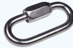
Quick Link Available from 3,5 mm to 14 mm W.L.L.: up to 1.110 Kg