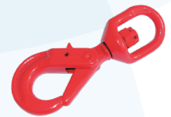
Grade 80 Swivel Self-Locking Hook W.L.L. available from 1.120 Kg to 8.000 Kg