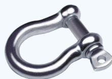
Bow Shackle Available from 5 mm to 36 mm W.L.L.: up to 4.000 Kg