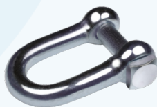
D-Shackle Square Head Available from 5 mm to 25 mm W.L.L.: up to 2.100 Kg