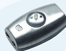
Egg-Shaped Wire Rope Clip Available from Ø 2 to Ø 6

These products are not PPE (Personal Protection Equipment)