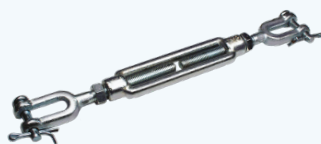
DIN 1480 Turnbuckle Jaw/Jaw Available from M6 to M36 W.L.L.: up to 7.165 Kg