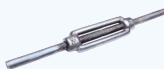
DIN 1480 Turnbuckle Welding Rod Available from M6 to M36 W.L.L.: up to 11.300 Kg