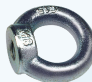
DIN 580 Lifting Eye Nut Available from M6 to M48 W.L.L.: up to 8.600 Kg

These products are not PPE (Personal Protection Equipment)