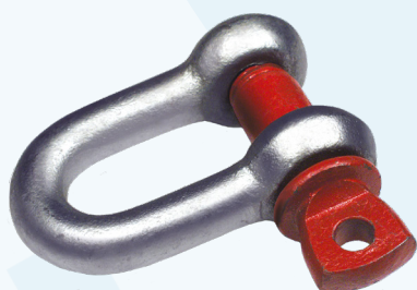
D-Shackle Heavy-Duty Available from 5 mm to 45 mm W.L.L.: up to 25.000 Kg