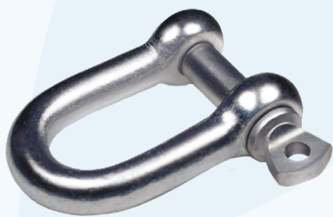
D-Shackle Available from 5 mm to 63 mm W.L.L.: up to 20.000 Kg