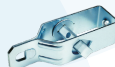
Wire Stretcher Available from 80x26 mm to 104x26 mm W.L.L.: up to 80 Kg