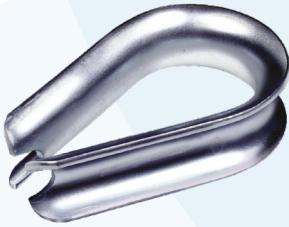
DIN 6899/A Wire Rope Thimbles Available from Ø 3,5 to Ø 24