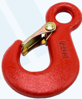
DIN 689 Lifting Hook with Safety Latch W.L.L. available from 250 Kg to 500 Kg