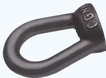
Oval Lifting Eye Available from M8 to M48 W.L.L.: up to 5.000 Kg