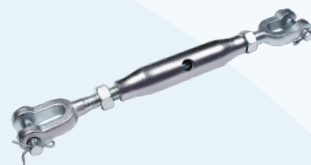
DIN 1478 Closed Body Turnbuckle Jaw/Jaw Available from M5 to M36 W.L.L.: up to 7.165 Kg