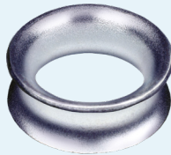
Round Wire Rope Thimbles Available from Ø 12 to Ø 18