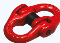
Cable Connector W.L.L. available from 1.120 Kg to 8.000 Kg