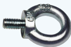
DIN 580 Lifting Eye Bolt Available from M6 to M48 W.L.L.: up to 8.600 Kg