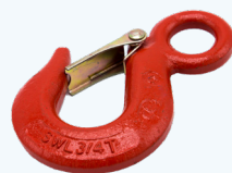
Carbon Steel / Alloy Steel Lifting Hook with Safety Latch W.L.L. available from 750 Kg to 7.000 Kg