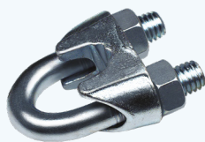
Wire Rope Clip U.S Type Available from Ø 2 to Ø 25