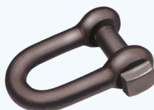
Trawling D-Shackle Square Head Available from 16/20 mm to 22/25 mm W.L.L.: up to 6.500 Kg