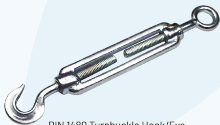
DIN 1480 Turnbuckle Hook/Eye Available from M5 to M36 W.L.L.: up to 2.665 Kg