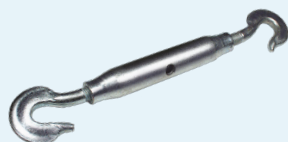
DIN 1478 Closed Body Turnbuckle Hook/Hook Available from M5 to M36 W.L.L.: up to 2.665 Kg