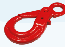
Grade 80 Eye Self-Locking Hook W.L.L. available from 1.120 Kg to 8.000 Kg