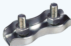
Duplex Wire Rope Clip Available from Ø 2 to Ø 8