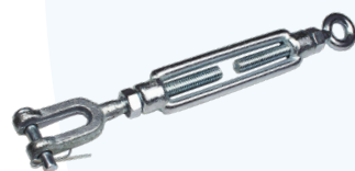
DIN 1480 Turnbuckle Jaw/Eye Available from M6 to M22 W.L.L.: up to 3.000 Kg