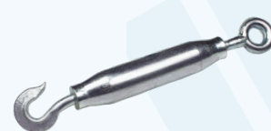
DIN 1478 Closed Body Turnbuckle Hook/Eye Available from M5 to M36 W.L.L.: up to 2.665 Kg