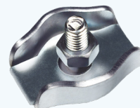
Simplex Wire Rope Clip Available from Ø 3 to Ø 6