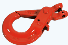
Grade 80 Clevis Self-Locking Hook W.L.L. available from 1.200 Kg to 8.000 Kg