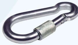
DIN 5299 with Safety Latch Available from 4x40 mm to 12x140 mm W.L.L.: up to 450 Kg