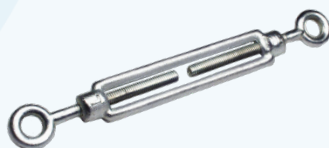
DIN 1480 Turnbuckle Eye/Eye Available from M5 to M36 W.L.L.: up to 8.665 Kg