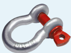
Bow Shackle Heavy-Duty Available from 5 mm to 22 mm W.L.L.: up to 6.500 Kg