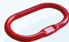
Oblong Master Link W.L.L. available from 1.600 Kg to 8.000 Kg

These products are not PPE (Personal Protection Equipment)