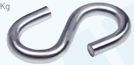
S-Hook Available from 3 mm to 10 mm W.L.L.: up to 180 Kg