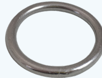
Welded Ring Available from 3 mm to 10 mm W.L.L.: up to 180 Kg