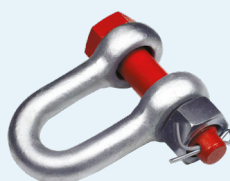
D-Shackle Heavy-Duty with Nut Available from 5 mm to 19 mm W.L.L.: up to 4.750 Kg