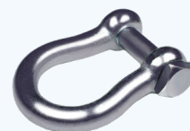
Bow Shackle Square Head Available from 5 mm to 22 mm W.L.L.: up to 1.500 Kg