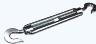
DIN 1480 Turnbuckle Hook/Hook Available from M5 to M36 W.L.L.: up to 2.665 Kg