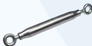
DIN 1478 Closed Body Turnbuckle Eye/Eye Available from M5 to M36 W.L.L.: up to 8.665 Kg