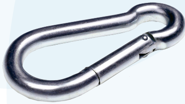
DIN 5299 Available from 4x40 mm to 15x200 mm W.L.L.: up to 650 Kg