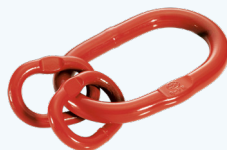
Master Link Assembly W.L.L. available from 2.360 Kg to 11.200 Kg