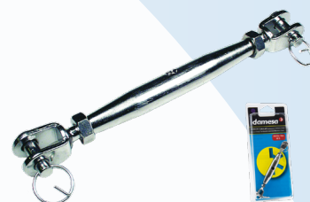
DIN 1478 Closed Body Turnbuckle Jaw/Jaw AISI 316