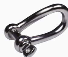
Twisted Shackle AISI 316