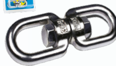
Eye/Eye Swivel AISI 316