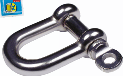
D-Shackle AISI 316