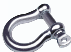
Grillete lira con punzón AISI 316