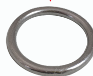
Welded Ring AISI 316