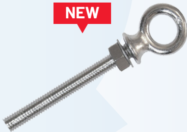
Long Eyebolt with Washer and Nut - AISI 316

Lifting Eye Bolts and Nuts are designed to lift loads. They incorporate either a section of threaded rod or a threaded screw hole which then is screwed down onto a threaded rod or bolt. The thread means that these Lifting Bolts and Nuts can be used to anchor or lash goods or machinery and also to carry out any lifting that may be required, taking into account application conditions at all times.