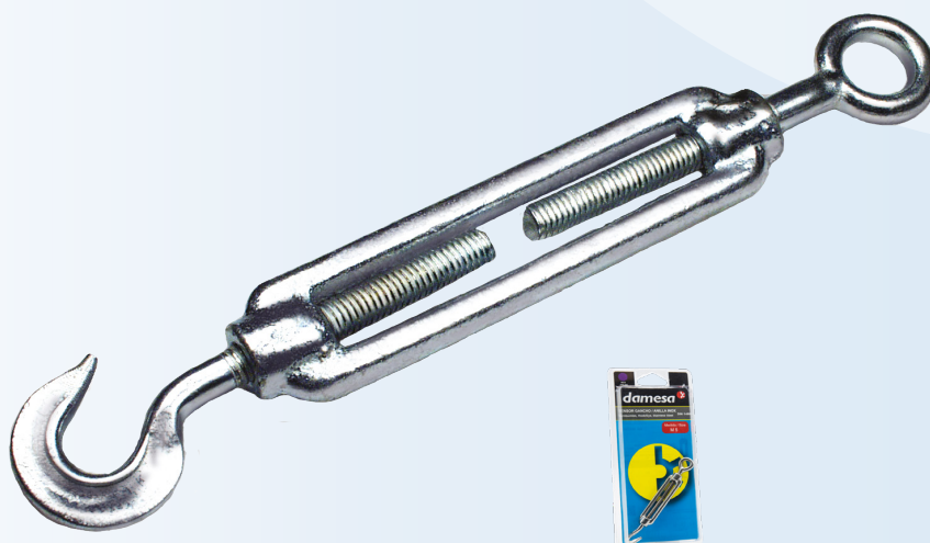
DIN 1480 Turnbuckle Hook/Eye AISI 316

These are the most commonly used elements for tightening cables, thanks to their safe and easy assembly. Any number of combinations are possible: hook/hook, hook/eye, jaw/jaw, etc. Our turnbuckles are manufactured in AISI 316, which is essential for corrosive or marine environments.