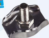
Sujetacable plano simple AISI 316