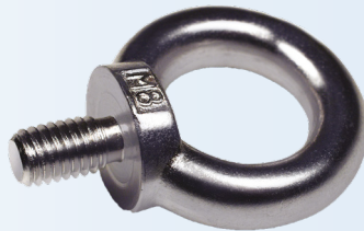
Lifting Eye Bolt - AISI 316