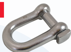
Square Head Shackle