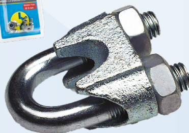
DIN 741 Wire Rope Clip AISI 316