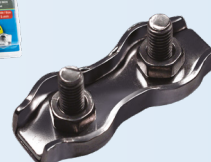
Duplex Wire Rope Clip AISI 316