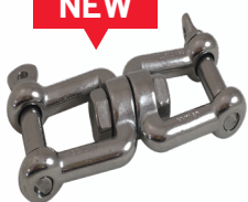
Double Rotating Shackle - AISI 316