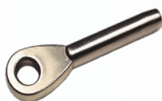
Turnbuckle eye end piece AISI 316