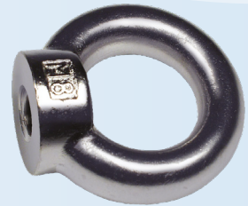
Lifting Eye Nut - AISI 316