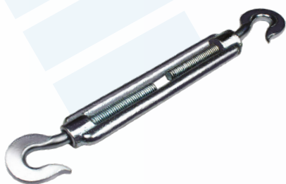
DIN 1480 Turnbuckle Hook/Hook AISI 316