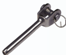
Turnbuckle jaw end piece AISI 316