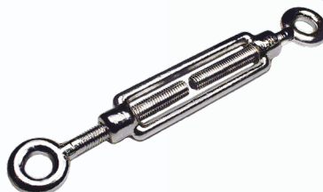
DIN 1480 Turnbuckle Eye/Eye AISI 316